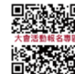
大會活動報名專區